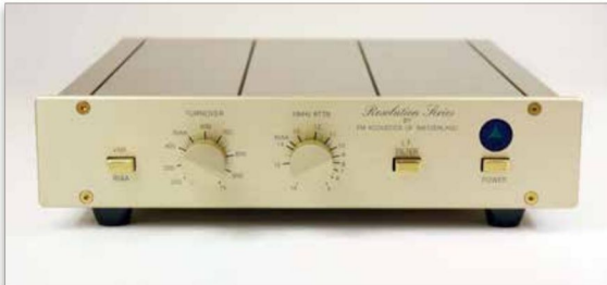
FM 122MKII Resolution Series Phono Linearizer