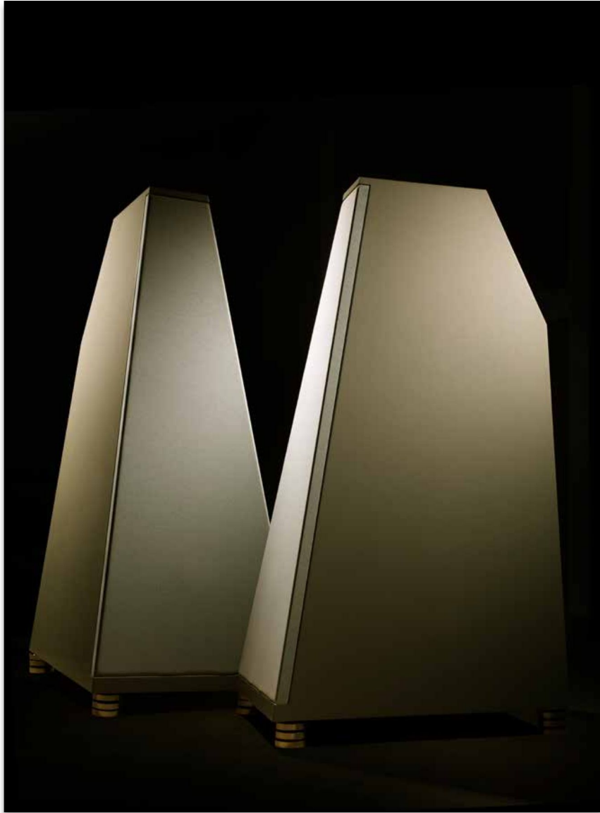
XS-III Inspiration System Loudspeaker