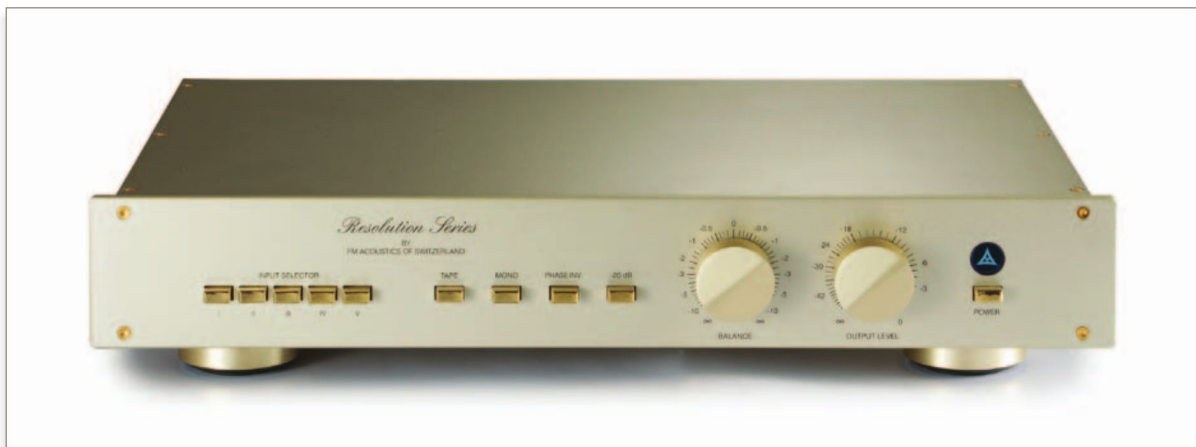
FM 255 MkII-R Resolution Series Preamplifier