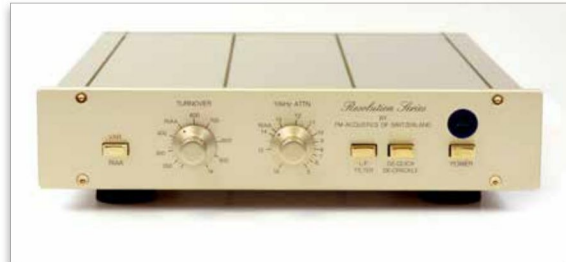
FM 123 Resolution Series Phono Linearizer