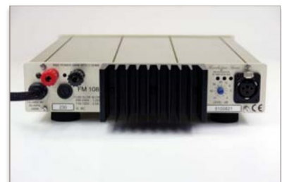
FM 108 Resolution Series Mono Power Amplifier