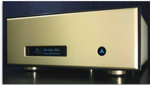
FM 411MkIII Resolution Series Stereo Power Amplifier