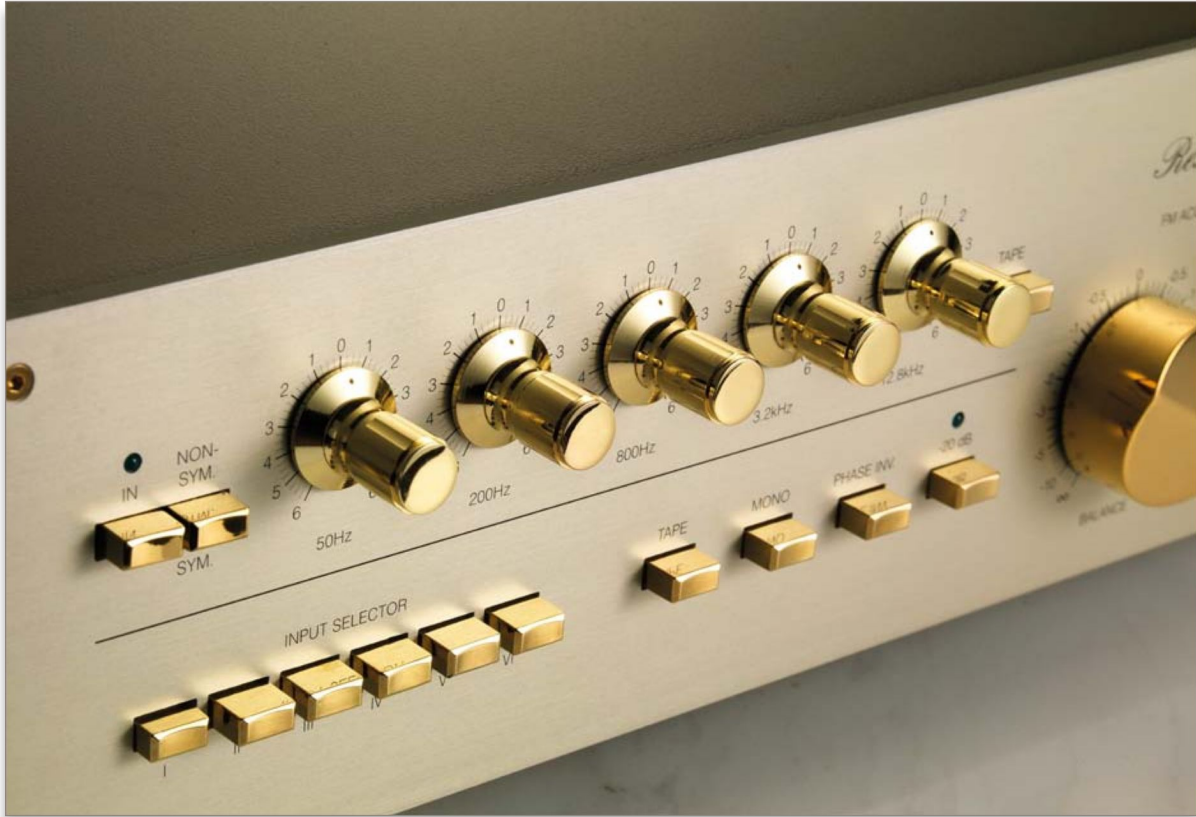
FM 268 CR Resolution Series Preamplifier