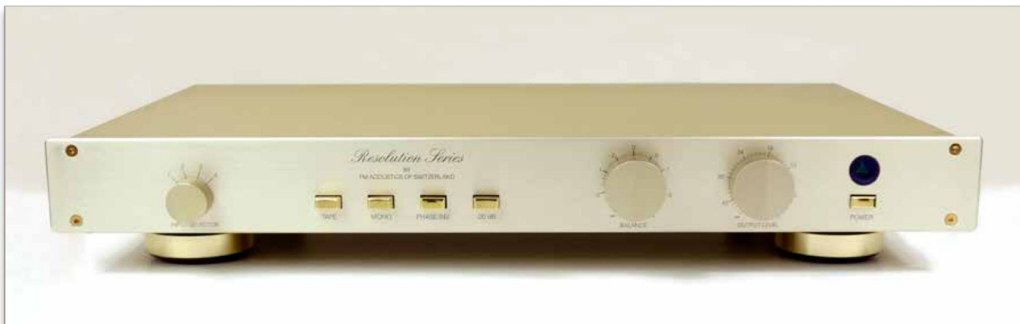
FM 245 Resolution Series Preamplifier