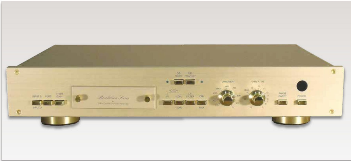
FM 223 Resolution Series Phono Master