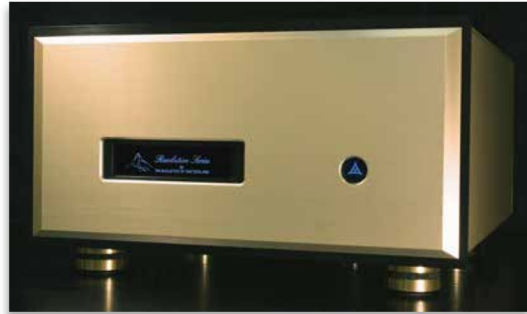
FM 711MkIII Resolution Series Stereo Power Amplifier